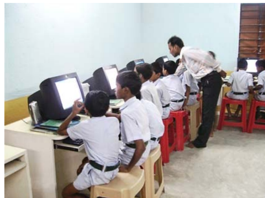
The Balashram Computer Lab

In order to devise and formulate more demonstrative and active classes and tuition, we are in need of the following teaching aids: one overhead projector, anatomic models of the human body, geometry models and 3-dimensional maps.